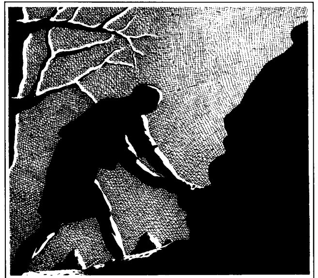
Gehazi quickly hid the money and clothing he had received from Naaman.

Gehazi was horrified. In a few seconds his skin became white with