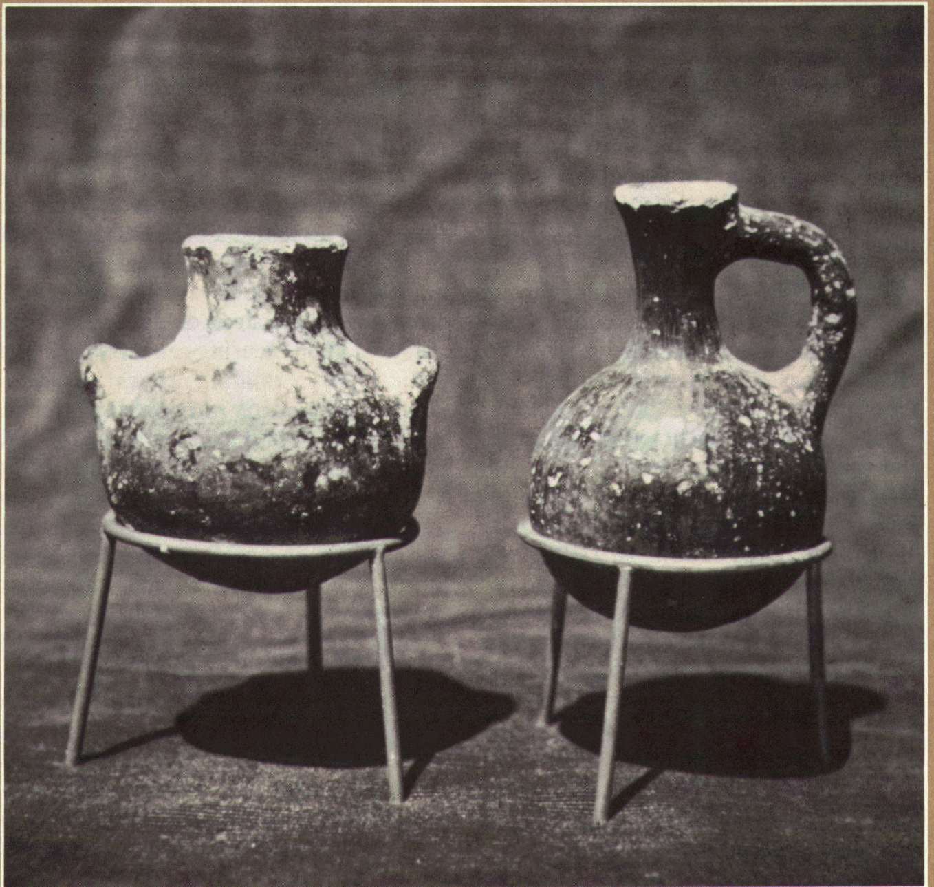
Elisha Succeeds Elijah